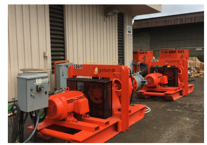
Electric Dri-Prime & Submersible Pumps