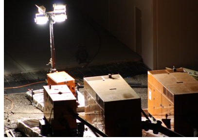
Diesel, Electric & Battery Powered Light Towers