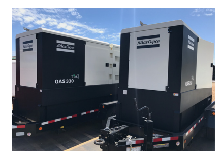
Portable & Standby Generators