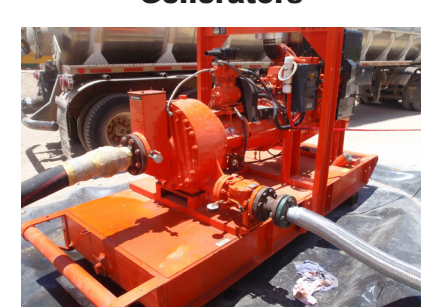
High Head Pumps for Temp Fire and Cleaning