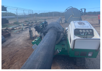
HDPE Fusion Equipment and Training