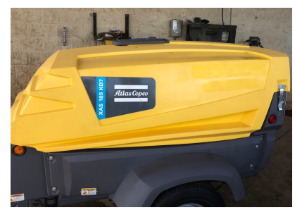
Portable & Industrial Air Compressors