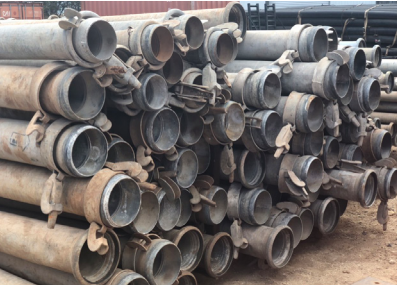
QD Piping, HDPE Piping, Hoses, & Fittings