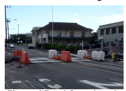
Flanged Road Crossings in a Range of Sizes